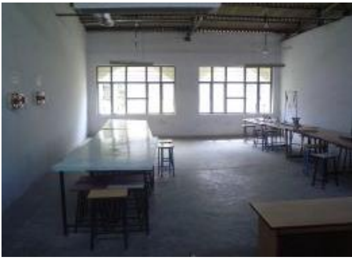
Engineering Mechanics Lab