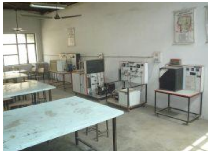
Refrigeration & Air Conditioning Lab