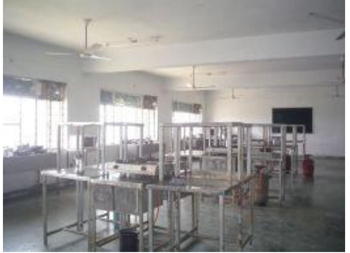
F& B Production lab