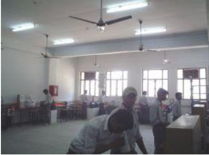
DC Machine Lab