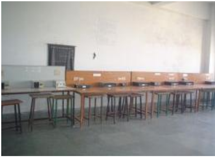
Digital Electronic Lab