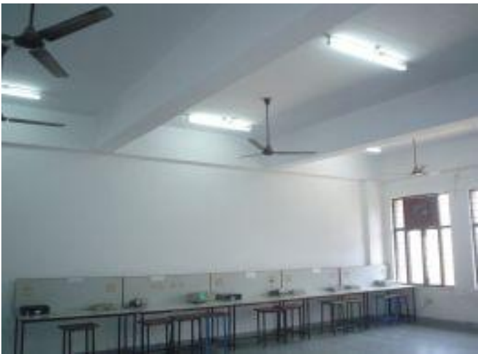
PCB & Electronic Workshop lab