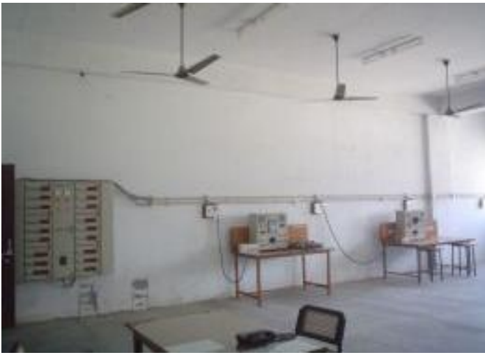
Power System Lab