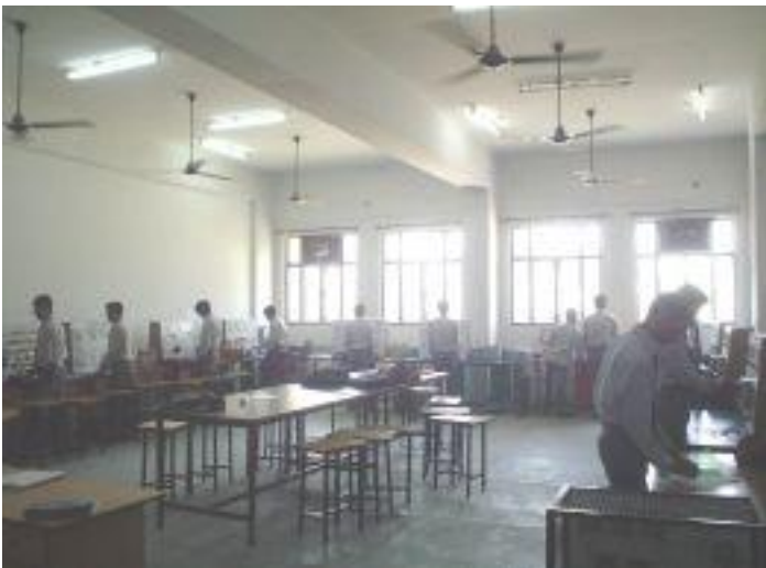
Electronic Engineering Lab