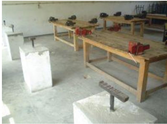
Sheet Metal Shop