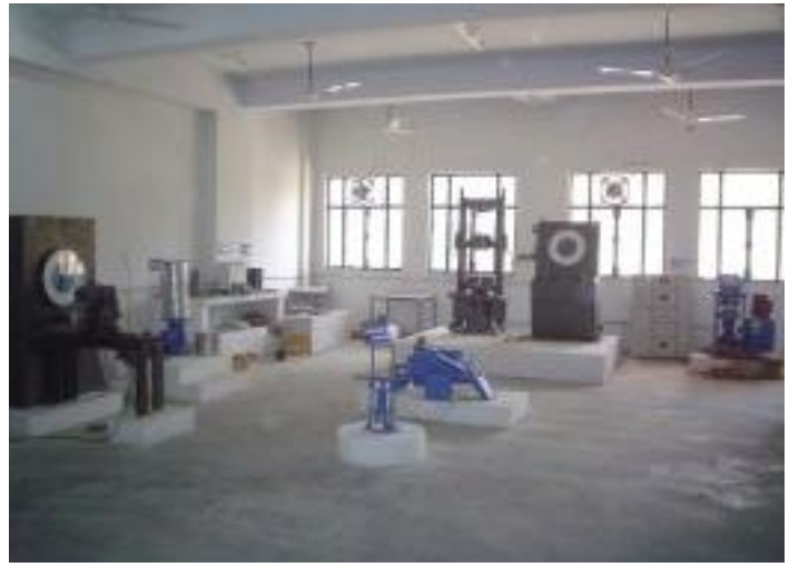
Building Material Lab