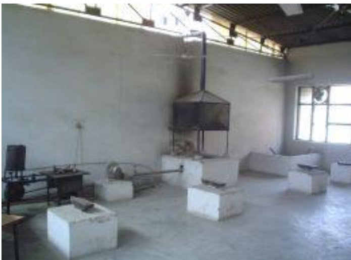
Black Smithy Shop