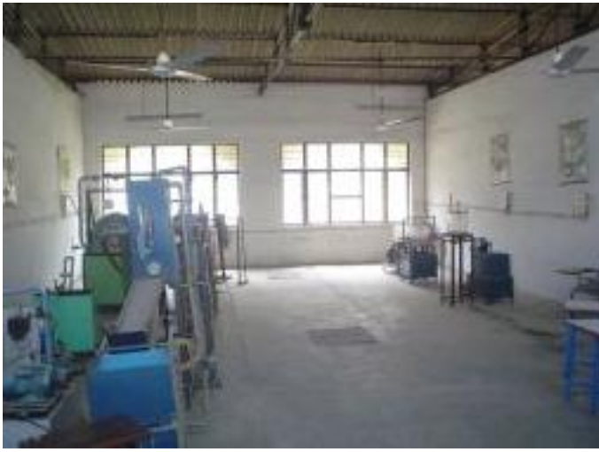
Fluid Machinery Lab