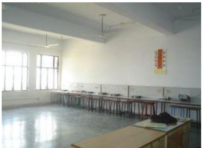
Electronic Circuit lab