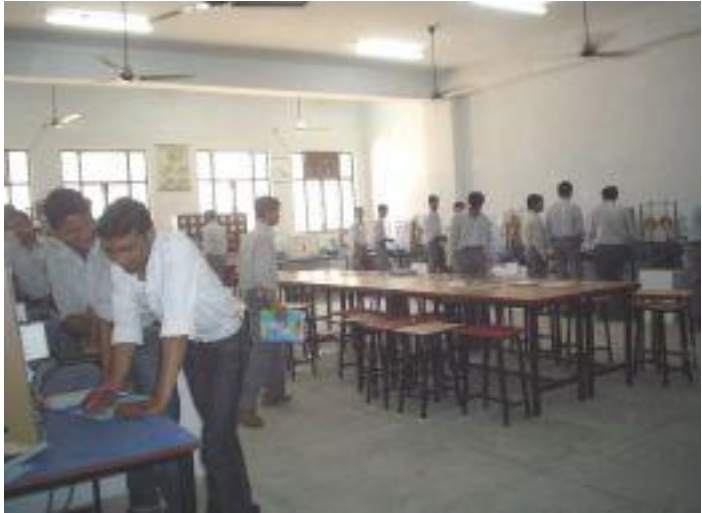
AC Machine Lab