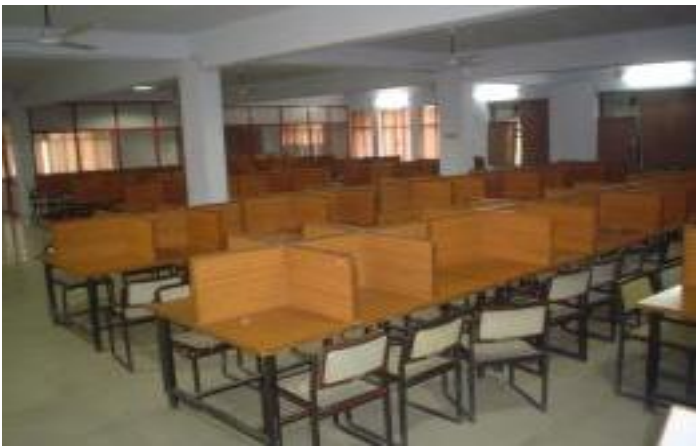
Reading Room (Library)