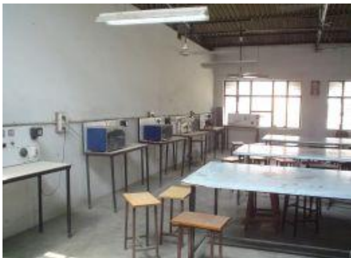
Heat & Mass Transfer