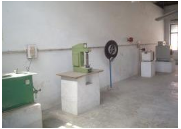
Material Science & Testing Lab