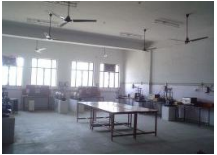
Electronic Drive Lab