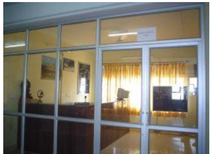
Front office Lab